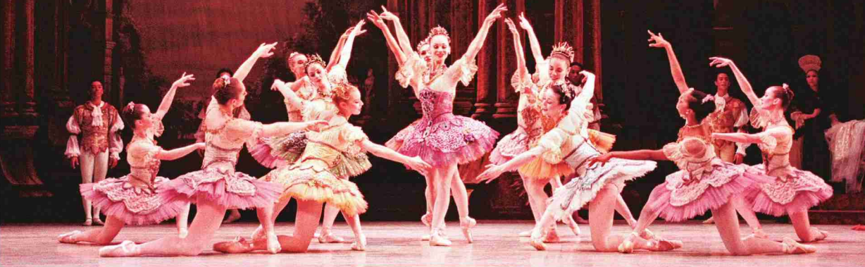
The Pennsylvania Ballet revisits a classic story-ballet with artistic director Angel Corella's take on "Sleeping Beauty."